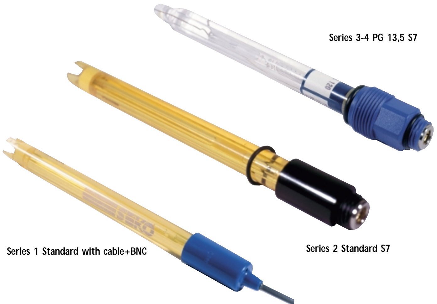
Series 1 Standard with cable+BNC

The elements that have to be considered in the choice of the electrodes are: range of measure, temperature, pressure, chemical substances present in the process, type of assembly of the electrode in the system.